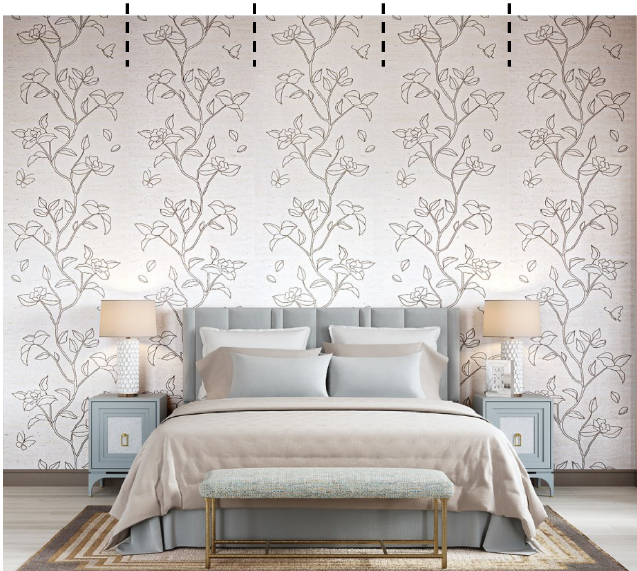
Diagram C) Straight Match