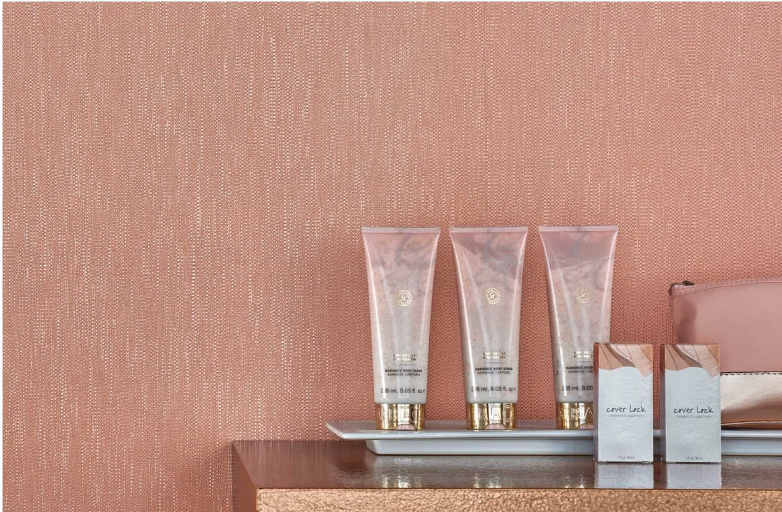
Rondelle Rose BB-BD-15